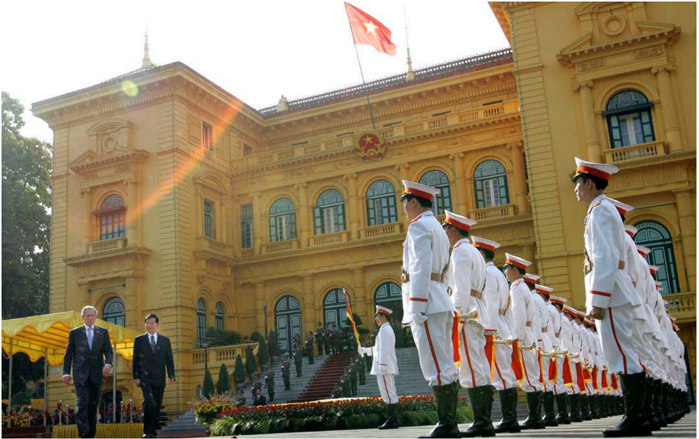
US president George W. Bush and Vietnamese president Nguyễn Minh Triết review an honor guard at the Presidential Palace in Hanoi on November 17, 2006. During the visit, the leaders released a joint statement agreeing to cooperate on remediating dioxin contamination sites in Vietnam.

by Vietnamese and international scientists found high levels of dioxin contamination on bases where the herbicides were used, stored, and loaded onto airplanes. 18 These findings were hard for the United States to refute. In a 2006 joint statement issued by President George W. Bush and President Nguyễn Minh Triết of Vietnam, the two countries agreed “that further joint efforts to address the environmental contamination near former dioxin storage sites would make a valuable contribution to the continued development of their bilateral relationship.” 19