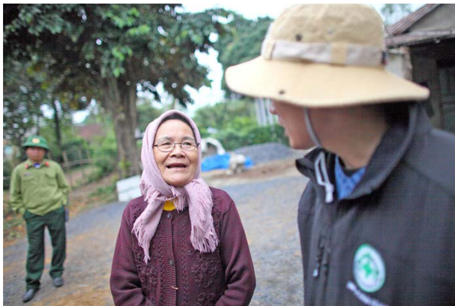
Project RENEW works in Quảng Trị, Vietnam, on January 14, 2010. The group supports victims of landmines and Agent Orange as part of its mission.