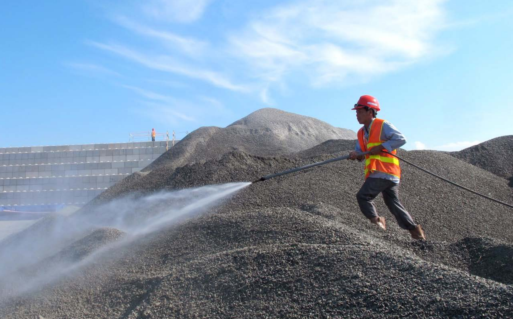
A worker sprays water over stones to be used in the construction of a silo for storing soil contaminated with dioxin at the site of a former U.S. air base in Danang, Vietnam, on April 24, 2013.