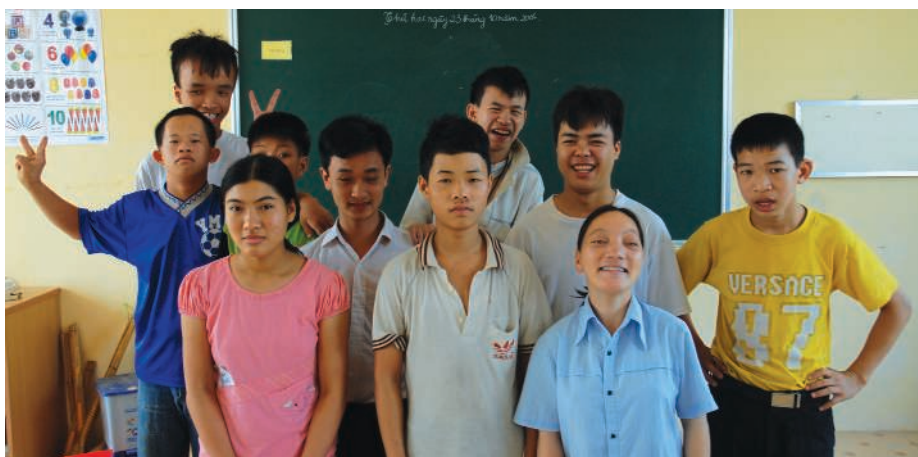
Potent symbol. Children of parents or grandparents exposed to Agent Orange attend a rehabilitation center at Friendship Village near Hanoi; Vietnam blames their problems on Agent Orange.

soil, Schecter and John Constable of Harvard University have found elevated dioxin levels in many of the roughly 4000 people they have tested. Schecter says that a handful of individuals living near a wartime herbicide storage area, Bien Hoa, had TCDD blood levels exceeding 400 parts per trillion. (The U.S. population averages 1 or 2 ppt.)