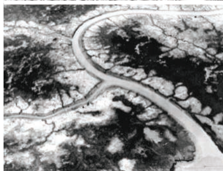
Chemical clearance. Normal mangroves (top) and a forest 5 years after defoliation.

mix of 2,4-dichlorophenoxyacetic acid (2,4-D) and two forms of 2,4,5-trichlorophenoxyacetic acid (2,4,5-T). Then in 1965, the military deployed Agent Orange, a faster-acting defoliant consisting of 2,4-D and a single form ( n -butyl ester) of 2,4,5-T. In a painstaking reanalysis of herbicide use during the Vietnam War, Columbia University chemist Jeanne Mager Stellman and her colleagues estimated that over 6 years, 45 million liters of Agent Orange were sprayed ( Nature , 17 April 2003, p. 681).